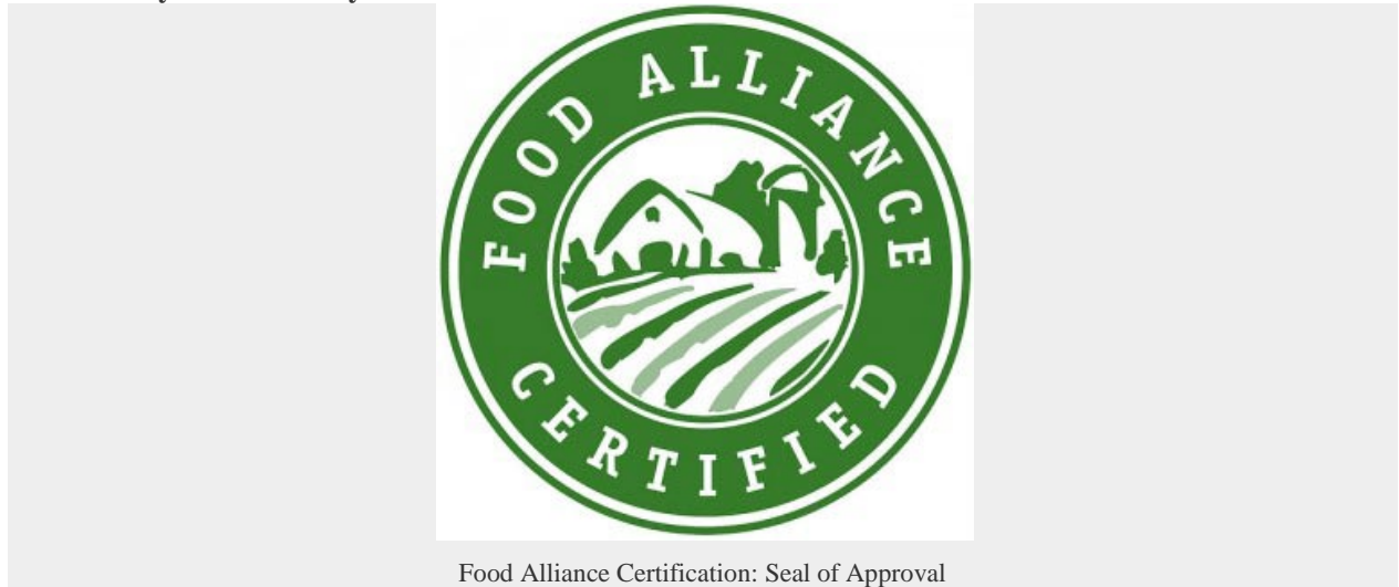
Food Alliance Certification: Seal of Approval

Food Alliance is an organization that provides third-party certification of sustainable agricultural operations. Farmers, ranchers, food processors and distributors, and other players in the food industry can demonstrate their commitment to socially and ecologically responsible practices by obtaining Food Alliance Certification.